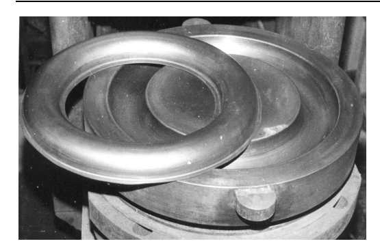
Fig. 3. General view of die and article "fairing" of 488 mm outside diameter from steel St3kp of 1,5 mm thickness

action (MDB) that allow to generate the optimized loading fields, which correspond to geometric parameters of a part. For example, during forming the part "fairing" (Fig. 3) that represents a half-torus, the load was applied only to the weighed-down segment of blank by connecting of corresponding electrodes of the installation UEHSh-2, excluding central zone where blank has round hole ac-