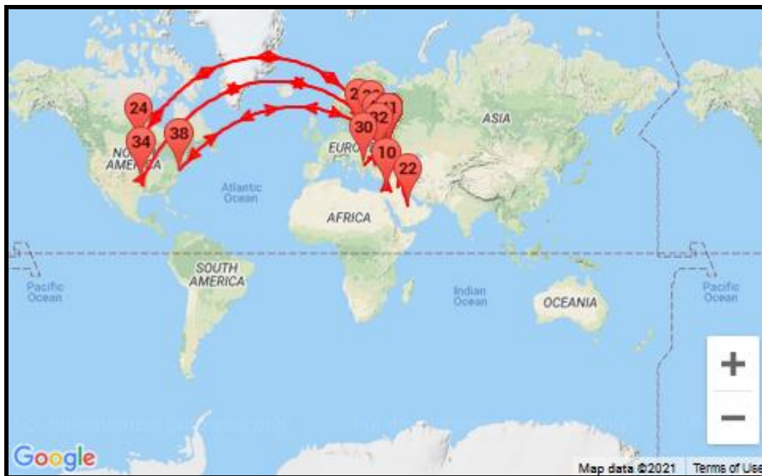
Fig. 3. GIS interface for purchases and sales

Such educational work was motivated by the fact that the most active students who provided successful additions to the educational material can become co-authors of the textbook. As a result, the textbook “Fundamentals of systems theory: innovative author’s technology of teaching “Partnership” was published in co-authorship with eight students. This experience made it